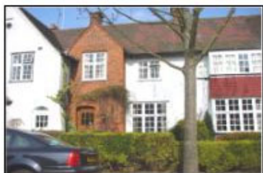
Grimshaw recently handled the sale of this property on Meadvale Road

If you are considering a sale, why not reap the benefit of our extensive local experience and vigorous marketing? The agents for your area, we always have a large register of waiting applicants willing to pay a full market price for a suitable property.