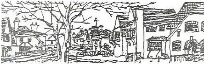
Brentham Garden Estate, Ealing