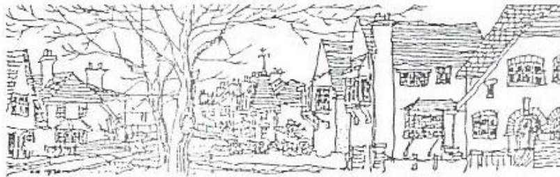
Brentham Garden Estate, Ealing