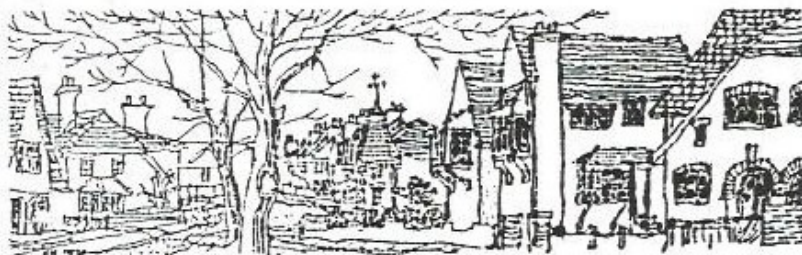
Brentham Garden Estate, Ealing