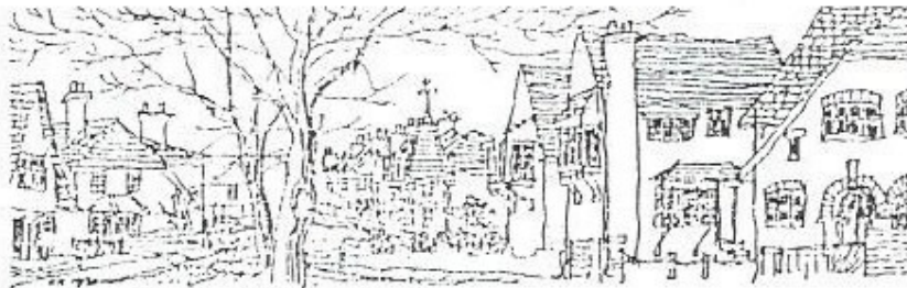
Brentham Garden Estate, Ealing