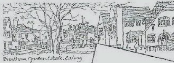
Brentham Garden Estate, Ealing