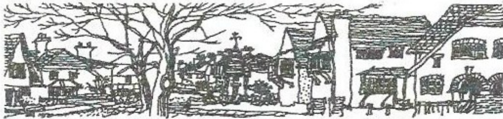
Brentham Garden Estate, Ealing