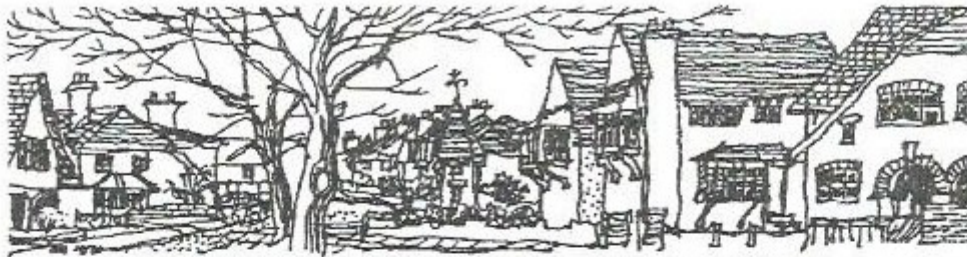
Brentham Garden Estate, Ealing