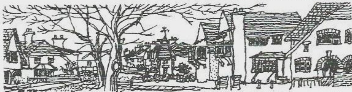
Brentham Garden Estate, Ealing